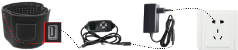
105pcs or 300pcs Red Light Therapy Belt