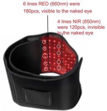
300pcs Light Therapy Belt