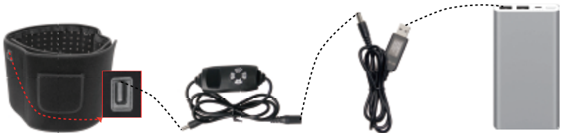
Only 105pcs Red Light Therapy Belt

Input Voltage: DC 12V. With Power Bank Cord, you can connect with any power bank (not included) which is DC 12V, and put the power bank to the bag.