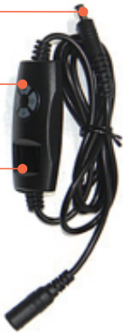
Remote Control and Cable

Plugs into DC Port on Remote Control Cable